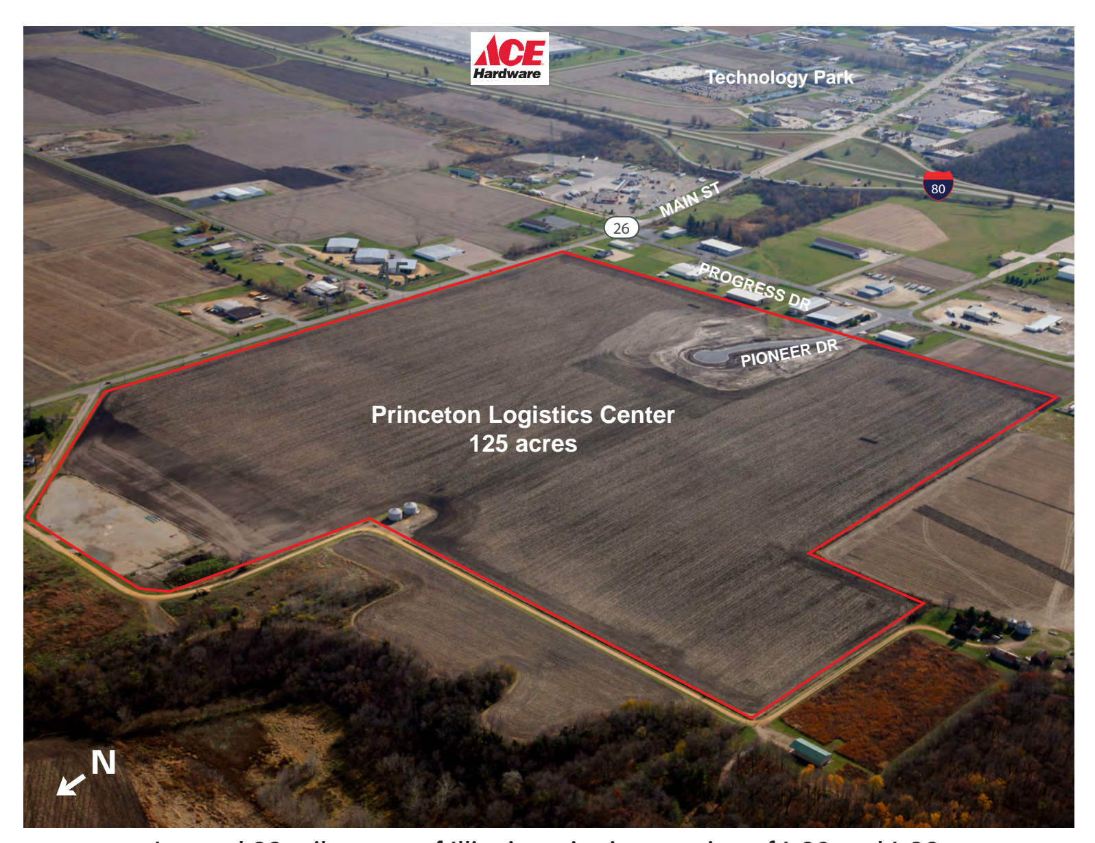
Located 22 miles west of Illinois major intersection of I-80 and I-39 Located in the Bureau / Putnam Enterprise Zone Developed Sites Are Available Cooperating Broker Participation Invited

67 Acre Master Planned Park Princeton, IL, Bureau County